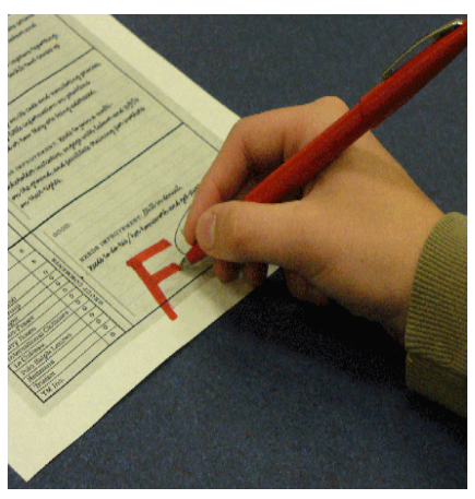
California schools receive a failing grade

To both reinforce compliance with existing laws and challenge schools and the education system to come into line with other settings, the California P&A conducted in-depth investigations into allegations of abusive restraint or seclusion practices involving seven students in six schools. These investigations revealed both the failure of school personnel to comply with existing regulations and the failure of current law to sufficiently regulate the use of these dangerous practices.