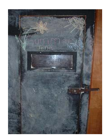
Tennessee seclusion door

In March 2007, the Tennessee P&A received a report from a parent in a Sumner County elementary school that their child was being put in a 4' by 3 ½' plywood box (on right). The P&A investigated and got the Sumner County School District to remove boxes throughout the school district (12 schools total). Since then, the school district has followed the P&A's recommendations to create appropriate calming areas and has allowed the P&A to continue to monitor the schools.