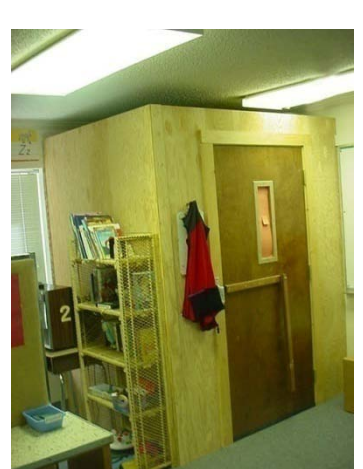
Classroom seclusion room, Kansas

troubling is that this room to seclude and isolate the child was actually a restroom. He had to even eat his meals in this restroom. He went in and was there the entire day, or was in there for the remainder of the day and because of this demeaning and negative intervention this would often lead to an incident.