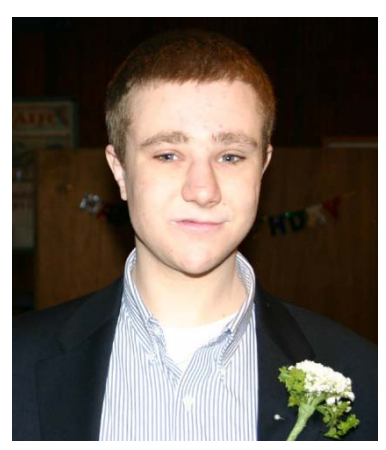
CT teenager injured from being restrained and secluded.

• When a high school student with autism became frustrated and allegedly struck an untrained aide, the aide pinned him to the floor, leaving him bruised and shaken. Following that incident, the school developed a behavior plan which his parents were told included a provision for him to calm down in a "safe place". However the parents were not told that the "safe place" was a hastily converted closet into which school personnel would routinely put the boy and hold him in isolation, sometimes for extended periods, while he cried and pounded on the door, begging to be let out.