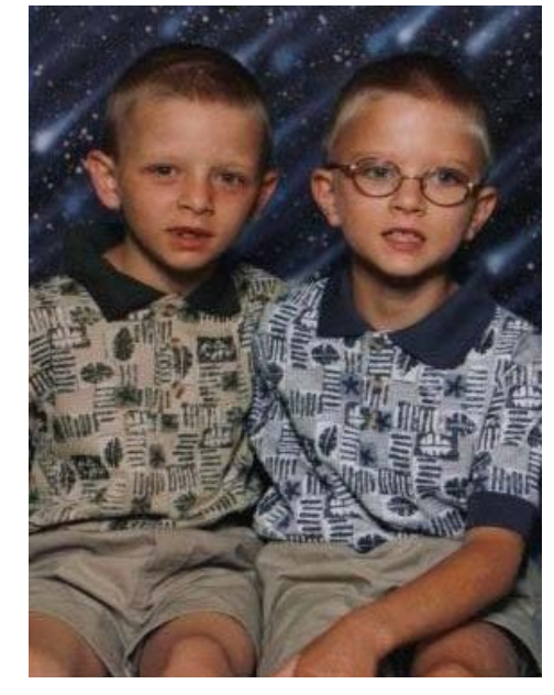
Connecticut children retraumatized when secluded

or area from which the person is physically prevented from leaving, "time-out" is a "behavior management technique that is part of an approved treatment program and may involve the separation of the individual from the group, in a non-locked setting, for the purpose of calming." 42 U.S.C. § 290ii(d)(4) and 290jj(d)(5).